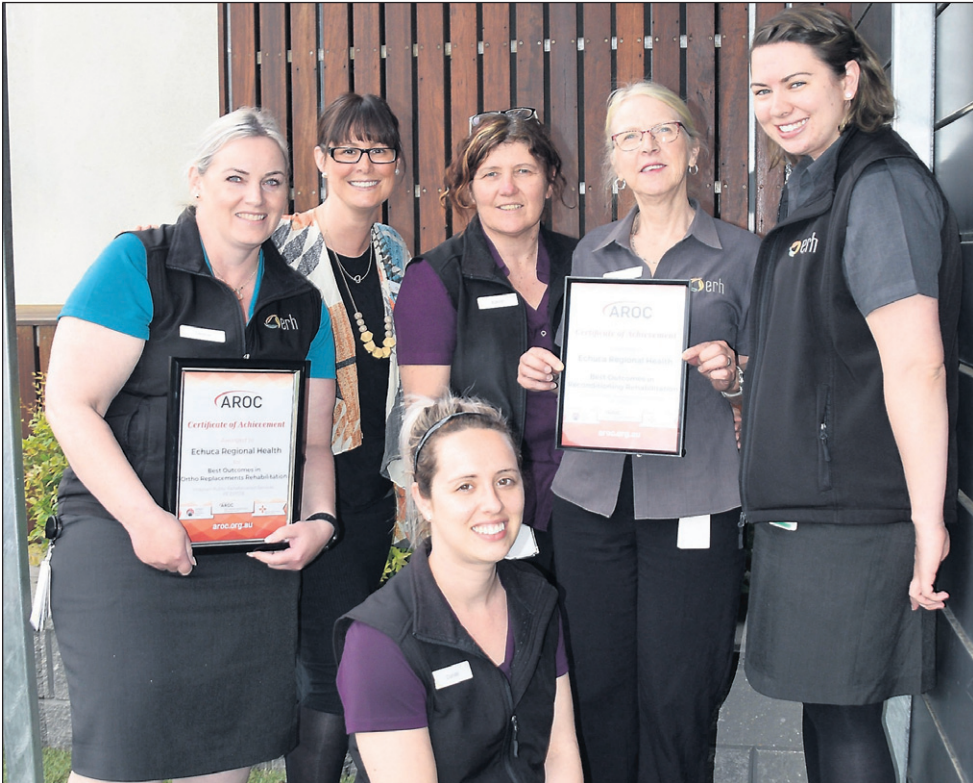
WHAT A TEAM: ERH's rehab ward has received two state awards.

For more information or to book, visit country.racing.com/echuca or call (03) 5482 2487